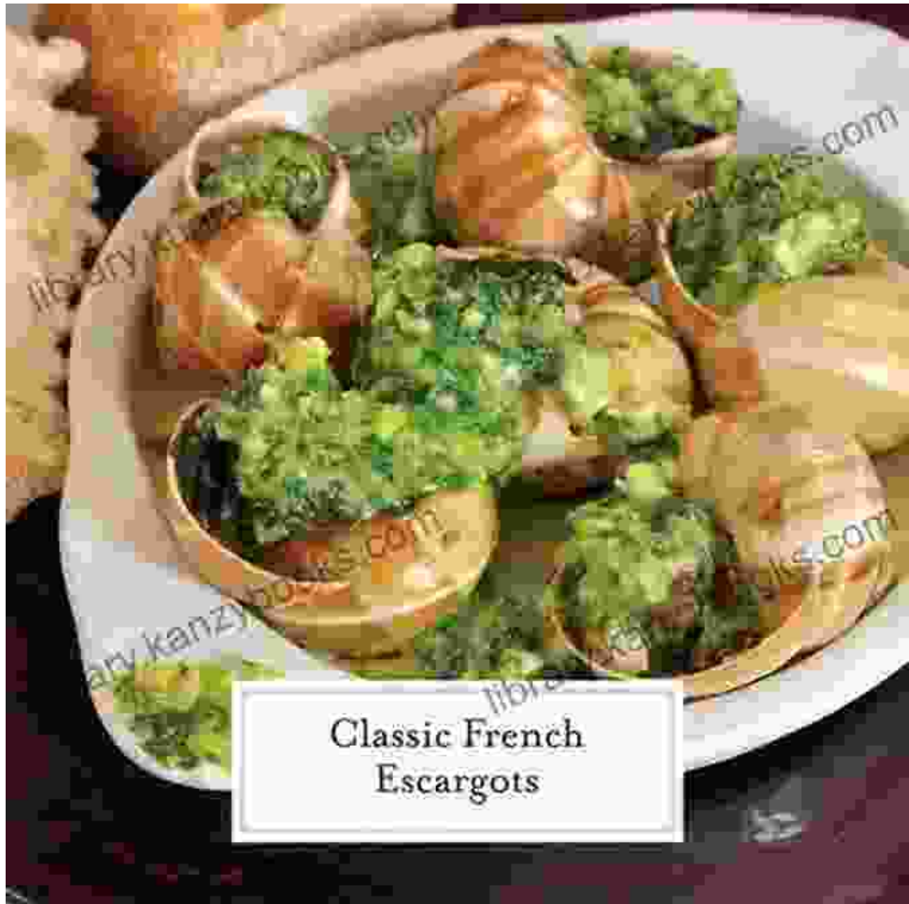
Classic French Escargots